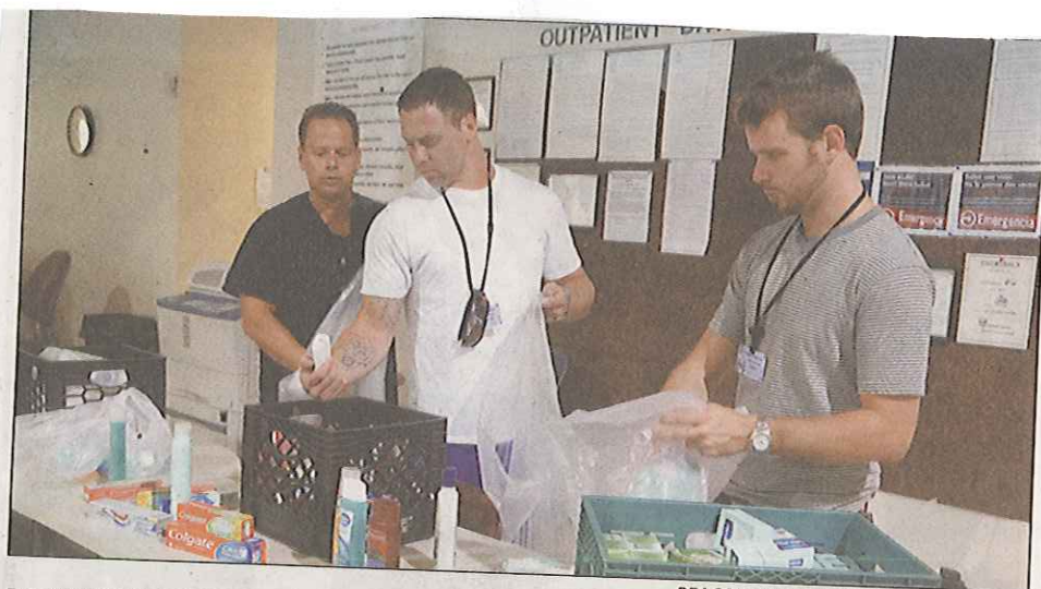
DONATIONS TO THE APPEAL Clients from Straight and Narrow sort out toiletries to be given out to residents.